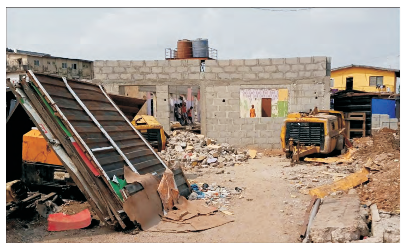
Site of the ongoing project

He added that the desire to residents always have to deal find a lasting solution to the unnecessary roadblock some the community also made the