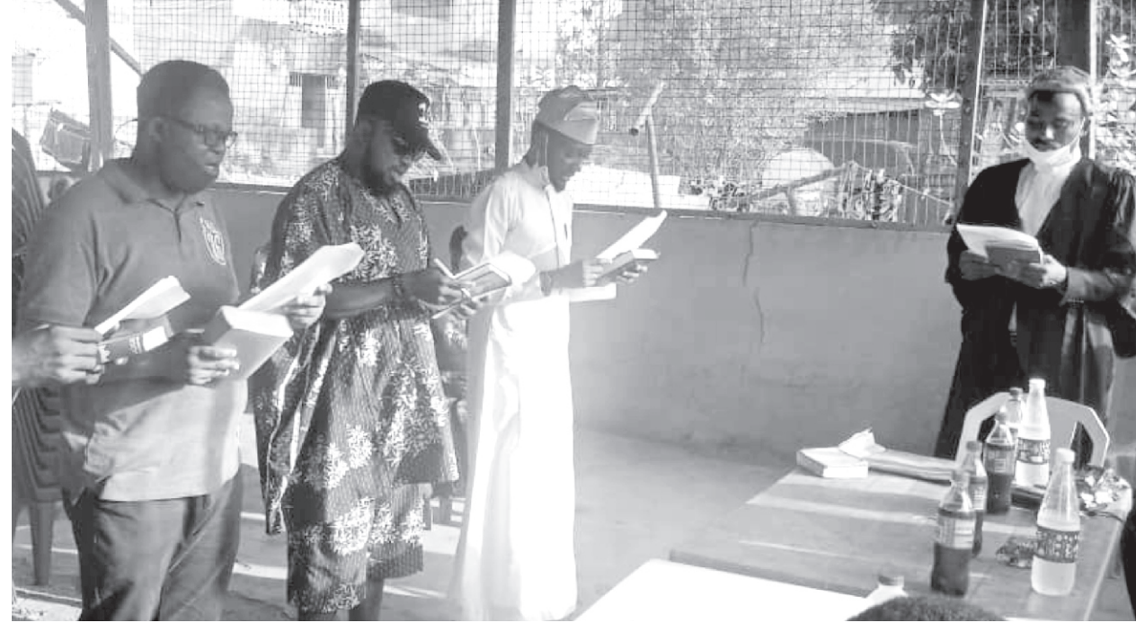
APC Oke-Afa ward interim caretaker committee taking oath of office

He pledged to move the party forward by mobilising residents of Oke-Afa ward to