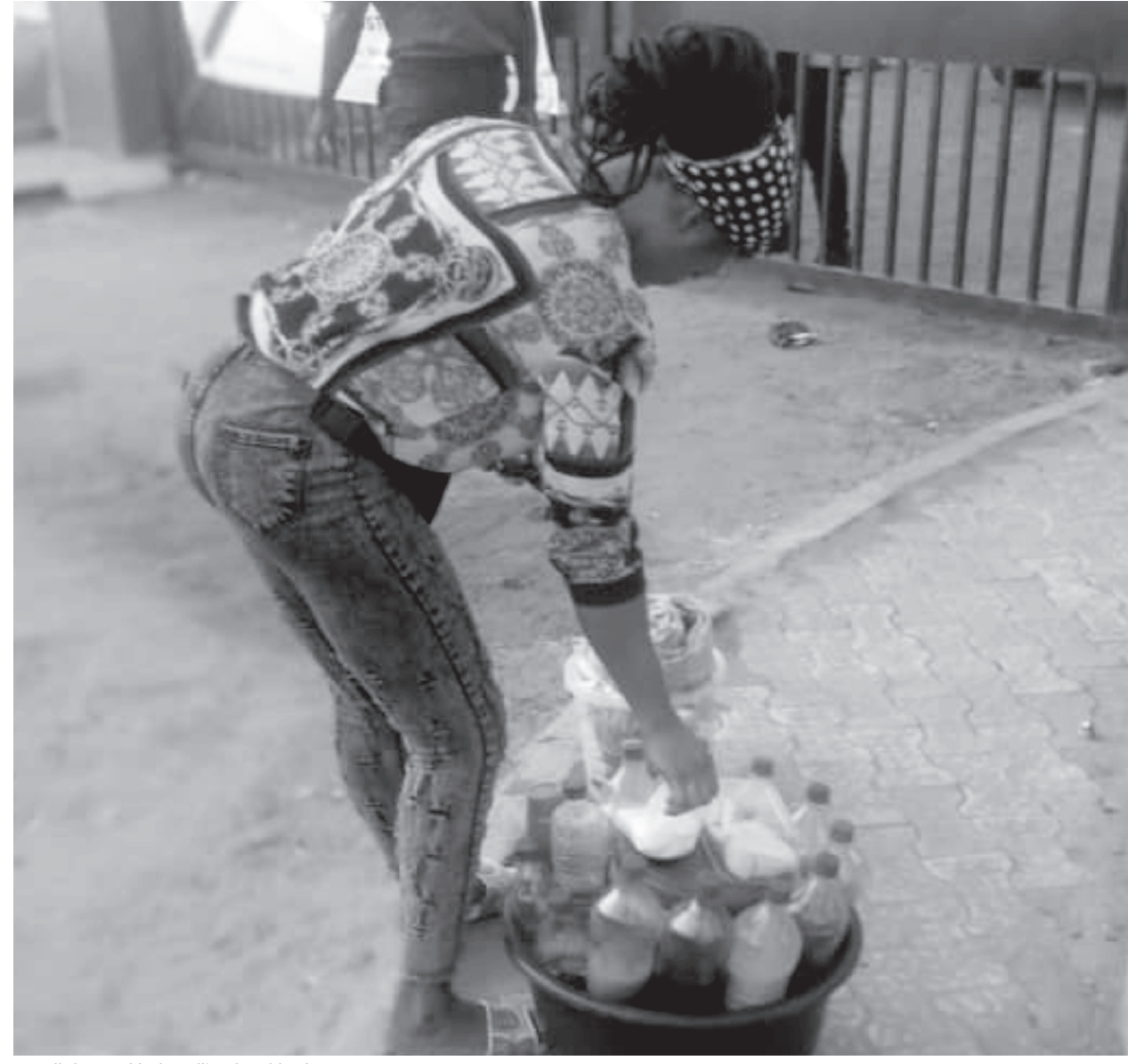
A well dressed lady selling local herbs

When asked whether she has been able to secure a good suitor with her dressing, she said she turned down most of those who wooed her