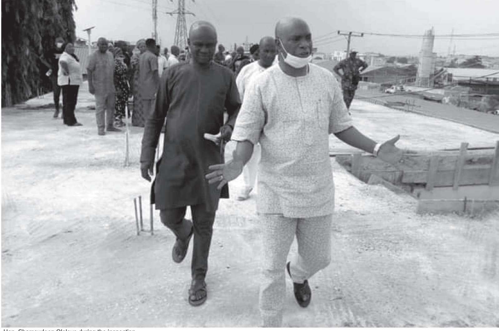
suffered delay due to dearth of Hon. Shamsudeen Olaleye during the inspection

Since the project began last year, the personnel in the affected offices including the office of National Population Commission (NPC), the office of Lagos State Residents